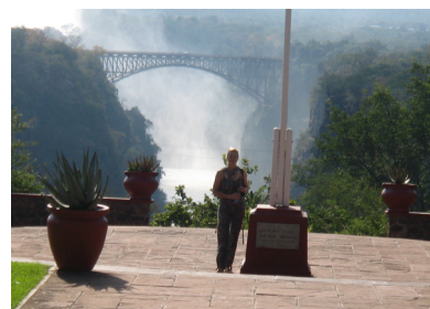
Victoria Falls Hotel