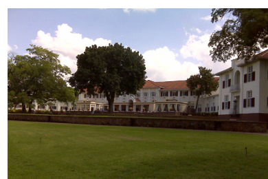
Victoria Falls Hotel